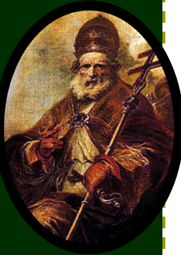
St. Leo the Great