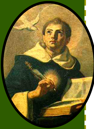
St. Thomas Aquinas

Jan 25: St. Paul's Conversion (c. 4 B.C.- c. 64). So important for Christianity – it is repeated three times in the Acts of the Apostles (chapter 9, 22:6ff and 26:12-18) and again in Galatians 1:15 -16. Read all three accounts today!