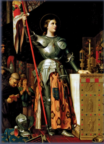
St. Joan of Arc