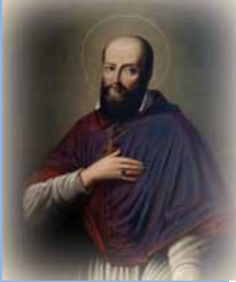
Bd. Barbe Avrillot Acarie

April 24: St. Fidelis von Sigmaringen (1578-1622) His baptismal name was Mark Roy – much easier to swallow – but he is known to the world as the glorious Franciscan Counter-Reformation martyr of the Swiss Canton Grisons. Check this quote, “I have come to enlighten you, not to accept your errors.” That comment alone inspired 20 armed men to butcher him.